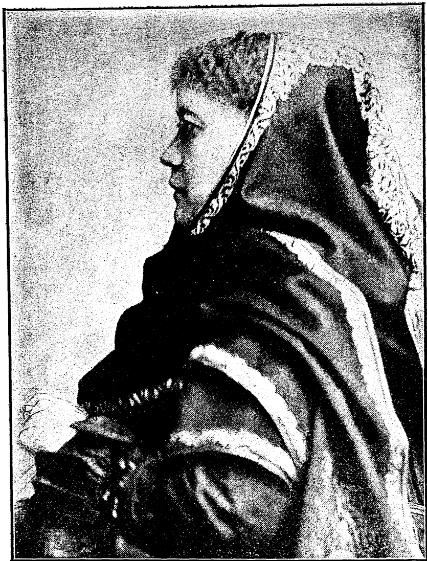
AN EARLY PROFILE OF H. P. B.